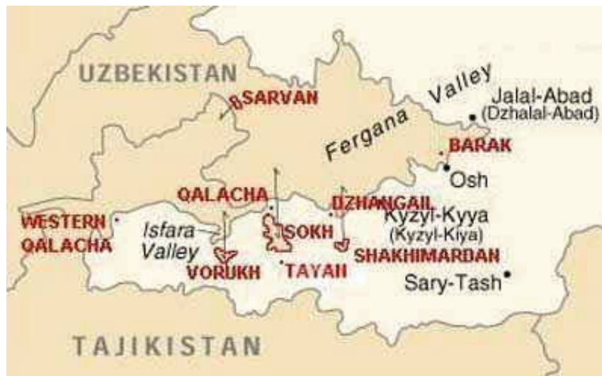
Map 2. Enclaves in the Ferghana Valley